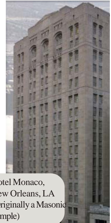
Hotel Monaco, New Orleans, LA (Originally a Masonic Temple)