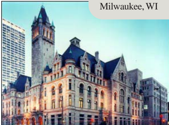
United States Federal Courthouse, Milwaukee, WI

The Hotel Cordorus located in York, PA has a history dating back to the 1820's. It is a building that has Landmark status, which posed a unique problem for the architectural firm of Murphy and Dittenhafer. The firm worked with Maine Glass, while following the standards of the Department of the Interior for the National Register of Historic Places.